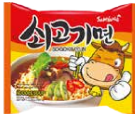
41020 SOGOKI RAMEN 20*120GR