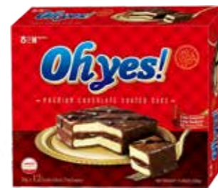
45011 OH YES, CHOCO CAKE 10*360GR