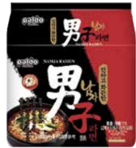
41016 NAMJA RAMEN (MULTIPACK) 4*(5*115GR)