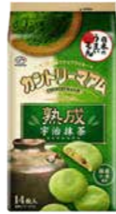
35023 COUNTRY MAA'M UJI- MATCHA 4*5*14PC