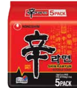
41002 SHIN RAMEN (MULTIPACK) 8*(5*120GR)