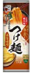
31011 ITSUKI TUKEMEN KOMI KARA MISO 20*260G