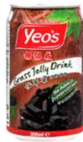
13005 GRASS JELLY DRINK 24*300ML