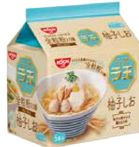
31003 RAO SHIO 3*6*5*96G