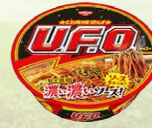
32005 YAKISOBA UFO CUP 12*128G