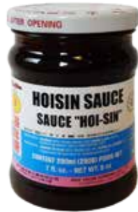
24009 HOISIN SAUCE 24*250GR