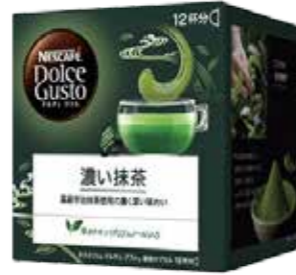
30002 NESCAFE DOLCE GUSTO CUPSULE RICH MATCHA 3*12PC