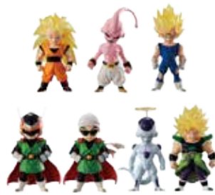
30004 DRAGON BALL ADVERGE 10 6*10*1PC