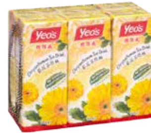
13006 CHRYSANTHEMUM TEA 4*(6*250ML)