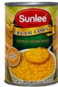
50011 CREAM CORN 24*410GR