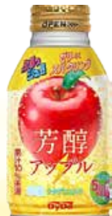
33008 PURUSSHU JELLY X SPARKLING RICH APPLE 24*270G