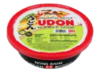
42007 UDON SOUP BOWL RAMEN 12*276GR