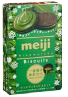
35007 RICH MATCHA BISCUIT 9*5*99G