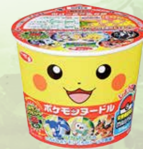
32006 POKEMON NOODLE SHOYU 12*38G