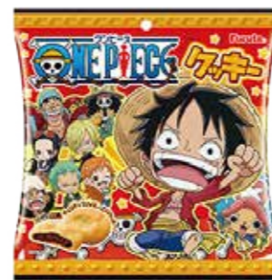
35031 ONE PIECE COOKIES (L) 2*12*147G