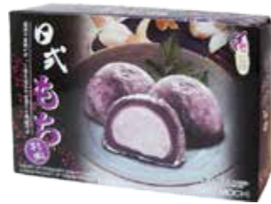
75005 JAPANESE STYLE MOCHI: TARO 24*210GR