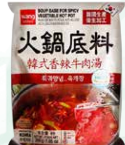
44011 HOT POT SOUP BASE: SPICY VEGETABLE 20*200GR