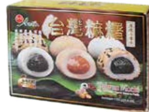
75006 MOCHI MIXED FLAVOURS 20*180GR