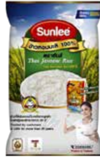
50001 JASMINE RICE 4*5KG