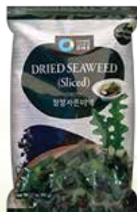
40012 DRIED SEAWEED CUT 30*50GR