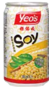
13004 SOYBEAN DRINK 24*300ML