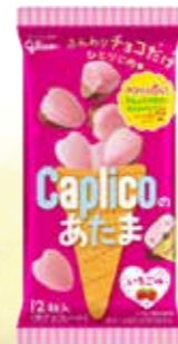
35003 CAPLICO NO ATAMA HART- GATA STRAWBERRY 12*10*30G