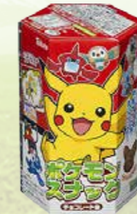
35017 POKEMON SNACK CHOCOLATE 8*6*23G