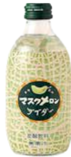
33037 MUSKMELON CIDER 24*300ML