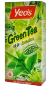
13003 JASMINE GREEN TEA DRINK 12*1L