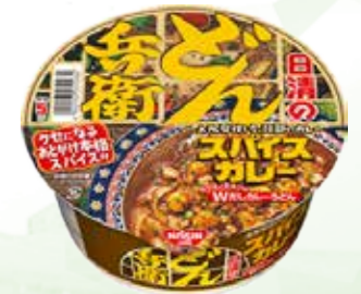
32003 DONBEI CUP KATSUO & CHICKEN CURRY UDON 12*87G