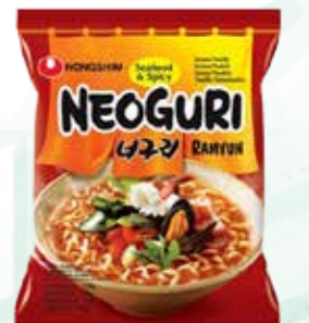
41007 NEOGURI HOT 20*120GR