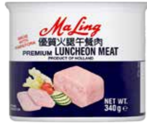
20001 LUNCHEON MEAT 12*340GR