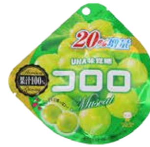
35036 KORORO GUMMY MUSCAT 12*6*40G