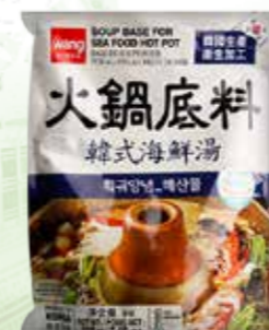
44012 HOT POT SOUP BASE: SEAFOOD 20*200GR