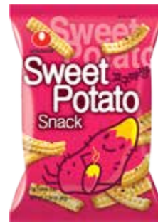
45005 SWEET POTATO SNACK 30*55GR