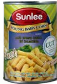
50009 BABYCORN CUT 24*410GR