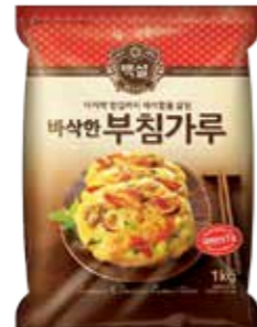
40010 PAN FRYING MIX 20*500GR