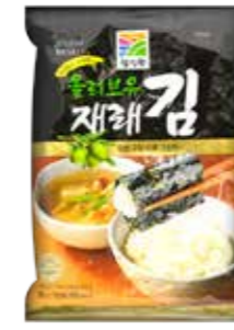
40017 SEASONED SEAWEED: JAERAE 20*20GR