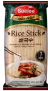
50004 RICE STICK VERMICELLI 34*454GR