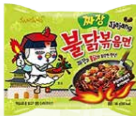
41024 HOT CHICKEN RAMEN JJA JANG 8*(5*140GR)