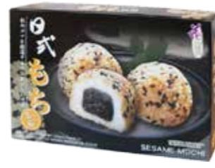
75002 JAPANESE STYLE MOCHI: SESAME 24*210GR