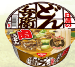
32004 DONBEI CUP NIKU-UDON 12*87G