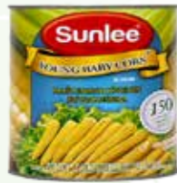
50008 BABYCORN 150+ 6*2950GR