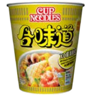
22003 XO SEAFOOD CUPRAMEN 24*75GR