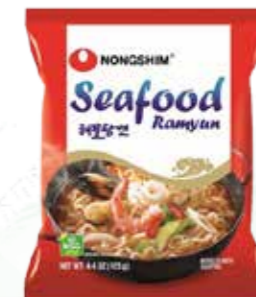
41006 SEAFOOD RAMEN 20*125GR