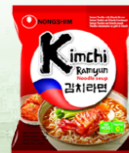
41009 KIMCHI RAMEN 20*120GR