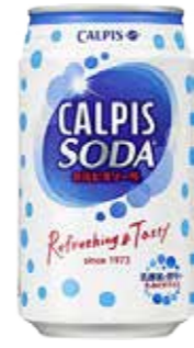
33031 CALPIS SODA 24*350ML