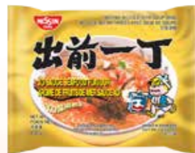
21009 XO SAUCE SEAFOOD RAMEN 3*30*100GR