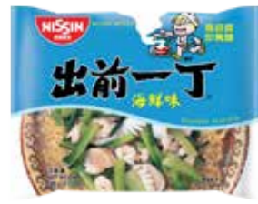
21004 SEAFOOD RAMEN 3*30*100GR