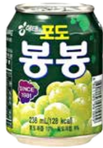
43001 GRAPE JUICE 24*238ML