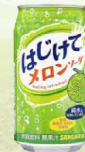
33025 HAJIKETE MELON SODA 24*350G