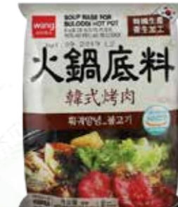
44010 HOT POT SOUP BASE: BULGOGI 20*200GR