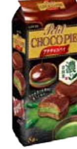
35010 PETIT CHOCO PIE RICH KYO MATCHA 4*5*8PC