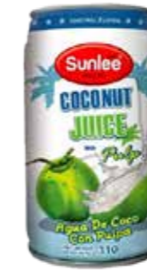
53001 COCONUT JUICE WITH PULP 24*310ML