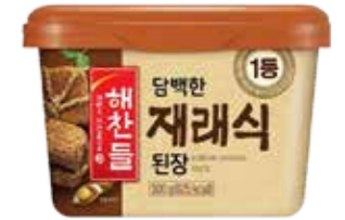
44003 SOYBEAN PASTE 20*500GR