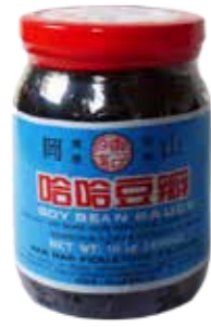
24005 BEAN PASTE 24*450GR