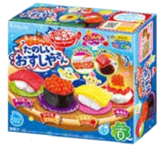
35011 DIY POP'N COOKIN TANOSHI OSUSHIYASAN 18*5*28.5G