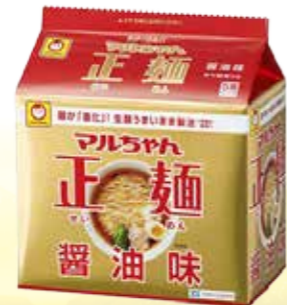
31006 MARUCHAN SEIMEN SHOYU 3*6*5*105G