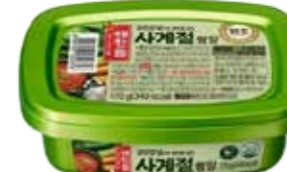
44006 SEASONED SOYBEAN PASTE 24*170GR