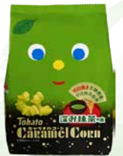
35015 CARAMEL CORN FUKAMI MATCHA 2*12*77G