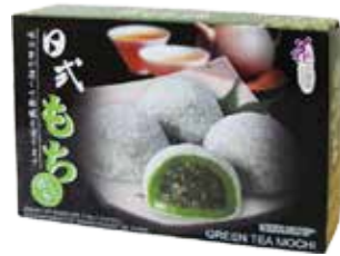
75004 JAPANESE STYLE MOCHI: GREEN TEA 24*210GR