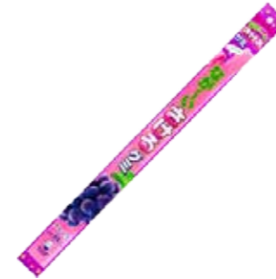
35037 NAGAI SAKERU GUMMY LONG GRAPE 8*10*1PC