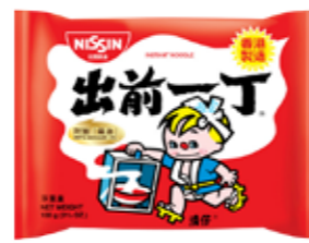
21003 SESAME RAMEN 3*30*100GR