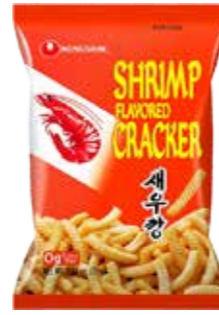
45003 SHRIMP CRACKER 30*75GR