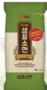
40013 SOMEN NOODLES THIN 15*900GR