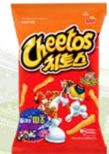
45014 CHITOS SNACK: BBQ 16*88GR