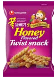
45004 HONEY TWIST SNACK 20*75GR