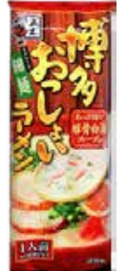
20*114G HAKATA OSSHOI RAMEN 20*123G