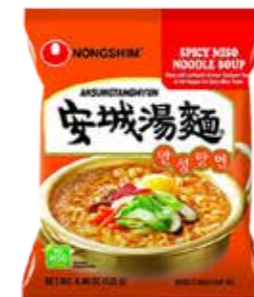
41005 ANSUNG TANGMYUN RAMEN 20*125GR