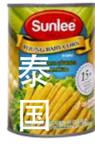
50007 BABYCORN 15+ 24*420GR