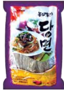
40001 STARCH VERMICELLI 20*500GR