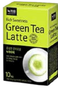
40002 GREEN TEA LATTE 20*130GR