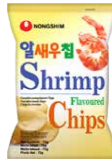
45007 SHRIMP CHIPS 20*75GR