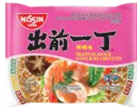
21005 PRAWN RAMEN 3*30*100GR