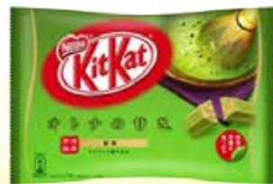
35001 KITKAT MINI MATCHA 2*12*146.9G