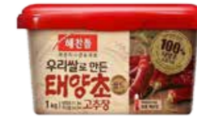
44002 RED PEPPER PASTE 12*1KG