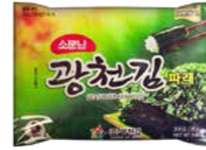
40016 SEASONED SEAWEED CUT: PARAE (6+3) 10*(9*5GR)