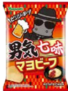
35029 OTOKO-GI SHICHIMI & MAYO BEEF CHIPS 12*90G