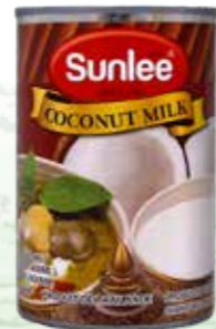
50014 COCONUT MILK (17-19%) 24*400ML