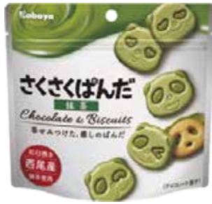
35021 SAKU SAKU PANDA MATCHA 9*8*47G