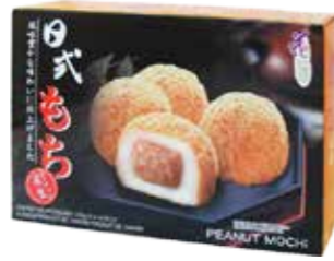
75001 JAPANESE STYLE MOCHI: PEANUT 24*210GR