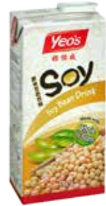
13001 SOYBEAN DRINK 12*1L