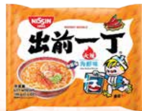
21008 SPICY SEAFOOD RAMEN 3*30*100GR