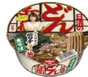
32001 DONBEI CUP SANSHO UMA-KARA RAHYU SOBA 12*98G