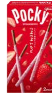
35005 POCKY TSUBU TSUBU ICHIGO 12*10*57.6G