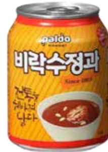
43002 CINNAMON PUNCH 6*(12*238ML)