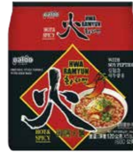
41015 HWA RAMEN (MULTIPACK) 4*(5*120GR)