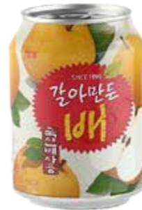
43003 CRUSHED PEAR JUICE 24*238ML