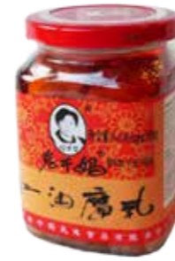
14004 PRESERVED BEANCURD IN CHILLI OIL 24*260GR