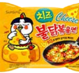
41022 HOT CHICKEN RAMEN CHEESE 8*(5*140GR)