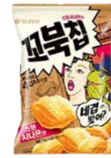
45022 CORN SNACK: CINNAMON 12*80GR