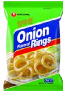
45001 ONION RINGS 20*90GR