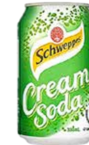
23001 CREAM SODA 3*(8*330ML)