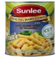
50010 BABYCORN CUT 6*2950GR