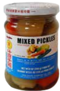
24013 MIXED PICKLES 24*250GR