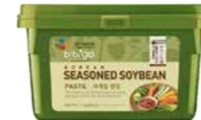
44005 SEASONED SOYBEAN PASTE 20*500GR