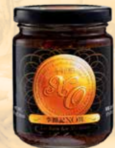
24003 XO SAUCE 12*220GR