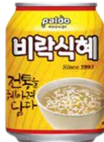
43010 RICE DRINK 6*(12*238ML)