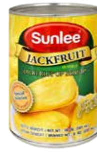
50016 JACKFRUIT IN SYRUP 24*565GR