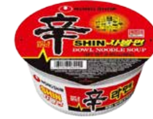
42002 SHIN BOWL RAMEN 12*86GR