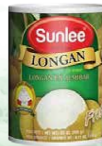
50015 LONGAN IN SYRUP 24*565GR