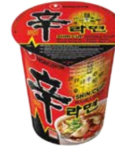
42001 SHIN CUPRAMEN 12*68GR