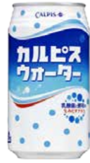
33030 CALPIS WATER 24*350G