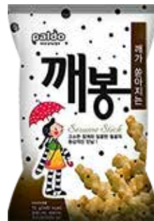
45008 SESAME SNACK 20*70GR