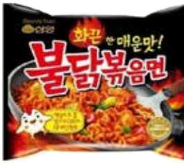
41021 HOT CHICKEN RAMEN 8*(5*140GR)