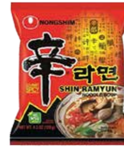
41001 SHIN RAMEN 20*120GR