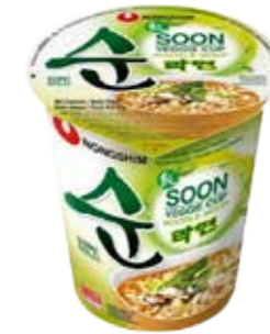
42004 SOON VEGGIE CUPRAMEN 12*67GR