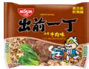
21002 BEEF RAMEN 3*30*100GR