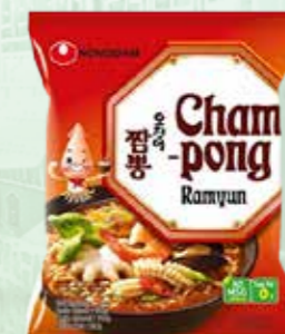
41010 CHAMPONG RAMEN 20*124GR