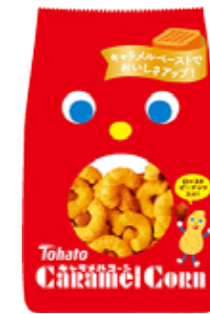
35014 CARAMEL CORN ORIGINAL 2*12*80G