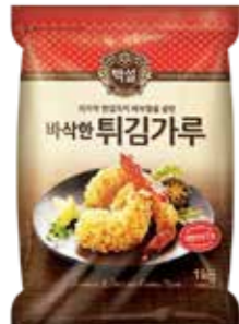
40009 FRYING BATTER MIX 20*500GR