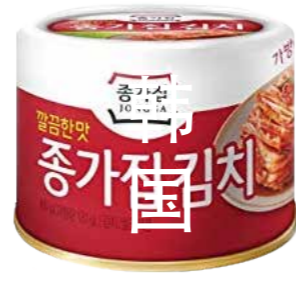
40007 MAT KIMCHI (CAN) 36*160GR