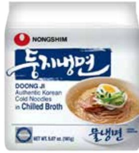
41012 COLD NOODLE (MULTIPACK) 8*(4*161GR)