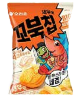
45023 CORN SNACK: SHRIMP 12*80GR