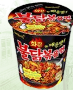
42012 HOT CHICKEN CUPRAMEN 6*70GR