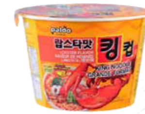
42009 LOBSTER KING CUPRAMEN 16*110GR