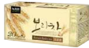
40004 BARLEY TEA 30*270GR