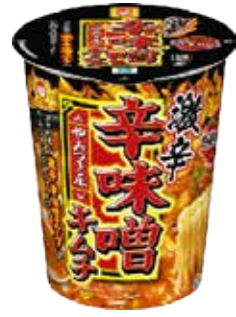
32008 YAMITSUKI-YA CUP SUPER HOTX2 MISO KIMCHI RAMEN 12*91G