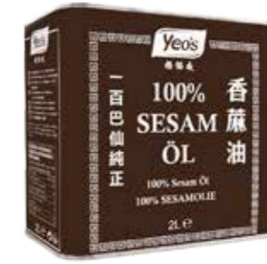
14006 SESAME OIL 100% PURE 6*2L