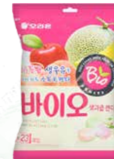
45026 SOFT FRUIT CANDY 14*99GR