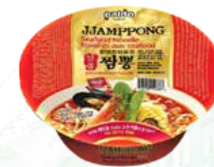
42010 JJAMPONG BOWL RAMEN 12*116GR