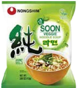
41003 SOON VEGGIE RAMEN 20*112GR