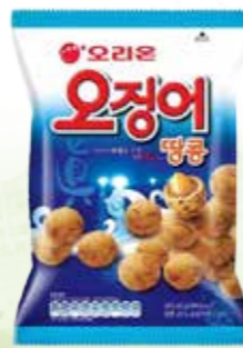
45015 CUTTLEFISH & PEANUT SNACK 16*98GR