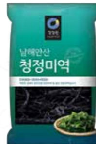
40011 DRIED SEAWEED 24*100GR