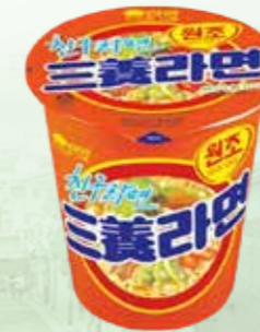
42013 SAMYANG CUPRAMEN 15*65GR