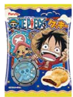
35030 ONE PIECE COOKIES (S) 4*10*63G