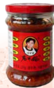
14003 FERMENTED SOYBEAN WITH CHILLI 24*210GR