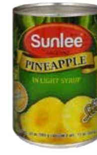
50017 PINEAPPLE IN SYRUP 24*565GR