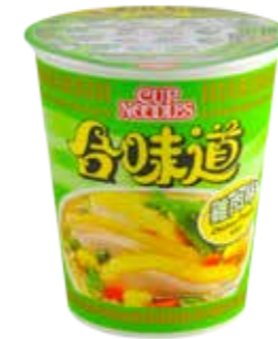
22004 CHICKEN CUPRAMEN 24*75GR