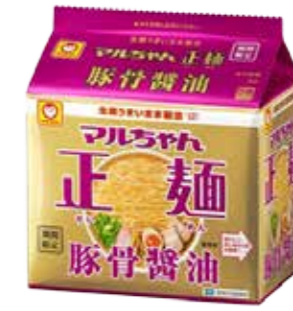
31010 SEIMEN TONKOTSU SHPOYU 3*6*5*101G