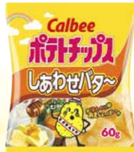
35033 POTATO CHIPS SHIAWASE HONEY & BUTTER 12*60G