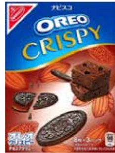
35026 OREO CRISPY CHOCO BROWNIE 4*10*154G