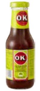
14007 OK SAUCE 12*335GR