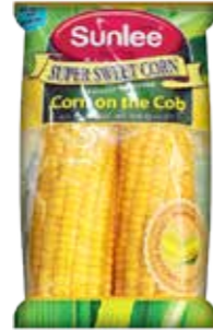
50006 CORN COB 32*450GR