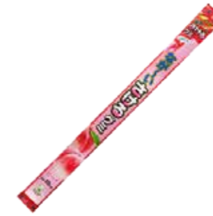
35038 NAGAI SAKERU GUMMY PEACH 8*10*1PC