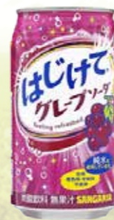
33024 HAJIKETE GRAPE SODA 24*350G