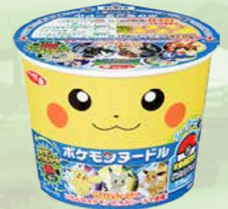
32007 POKEMON NOODLE SEAFOOD 12*37G