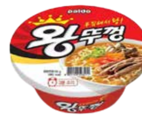
42008 KING BOWL RAMEN 18*110GR