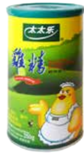
10001 GRANULATED CHICKEN FLAVOUR BOUILLON 12*250GR