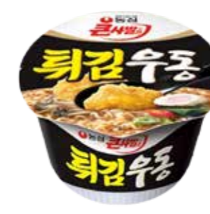
42005 UDON BOWL RAMEN 16*111GR