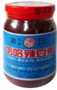
24004 HOT BEAN PASTE 24*450GR