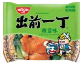
21001 CHICKEN RAMEN gram 3*30*100GR