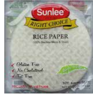
50003 RICE PAPER (22CM) 44*340GR