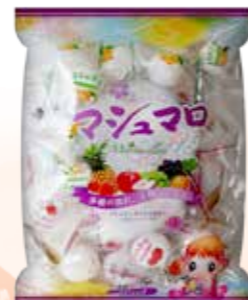
25003 MARSHMALLOW MIX 12*250GR