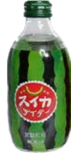
33035 WATERMELON CIDER 24*300ML