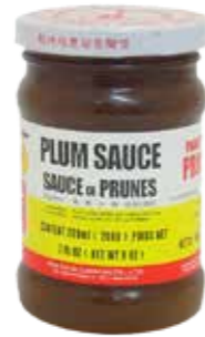
24011 PLUM SAUCE 24*250GR