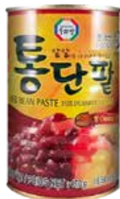
40008 RED BEAN PASTE 24*470GR