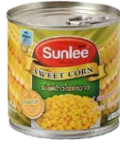
50005 CANNED SWEET CORN 24*340GR