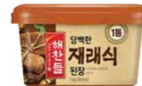
44004 SOYBEAN PASTE 12*1KG