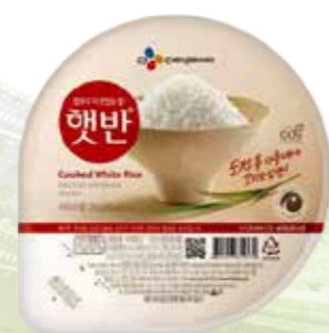
40014 COOKED RICE 36*210GR