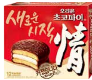
45010 CHOCO PIE 8*(12*39GR)