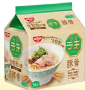
31004 RAO TONKOTSU 3*6*5*86G