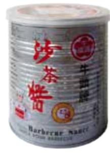
24006 BARBECUE SAUCE 12*737GR