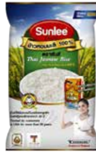
50002 JASMINE RICE 20KG