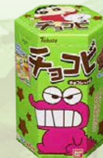
35018 CRAYON SHIN-CHAN CHOCOBI 8*6*25G