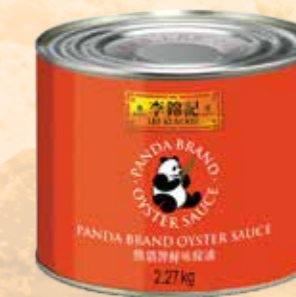
24002 PANDA OYSTER SAUCE 6*2.27KG