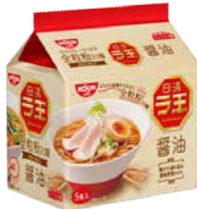
31001 RAO SHOYU 3*6*5*102G