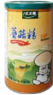
10002 GRANULATED MUSHROOM BOUILLON 12*227GR