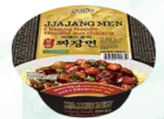
42011 JJA JANG MEN BOWL RAMEN 12*190GR