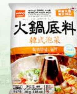
44013 HOT POT SOUP BASE: KIMCHI 20*200GR