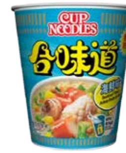
22001 SEAFOON CUPRAMEN 24*75GR