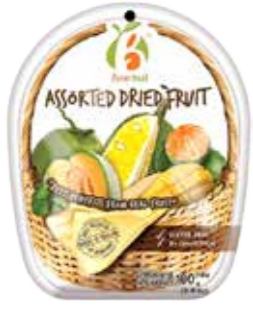
55004 DRIED ASSORTED FRUIT 48*100GR