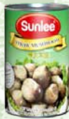
50012 STRAW MUSHROOM 24*420GR