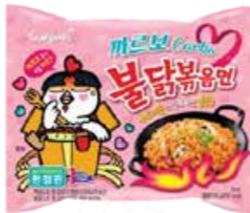
41023 HOT CHICKEN RAMEN CARBO 8*(5*130GR)