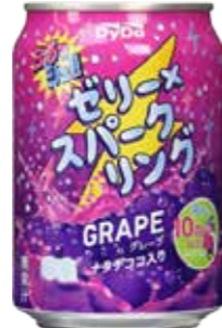
33006 PURUSSHU JERRY X SPARKLING GRAPE 24*280G