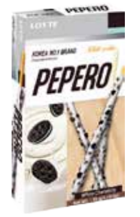
45019 PEPERO: WHITE COOKIE 40*32GR