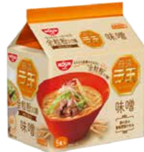
31002 RAO MISO 3*6*5*102G