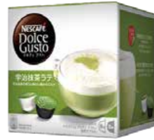
30003 NESCAFE DOLCE GUSTO CUPSULE UJI-MATCHA LATTE 3*16PC