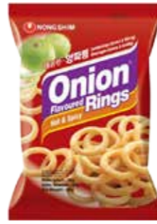
45002 ONION RINGS HOT 20*40GR