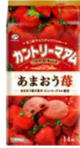
35022 COUNTRY MAA'M AMAOH ICHIGO 4*5*14PC