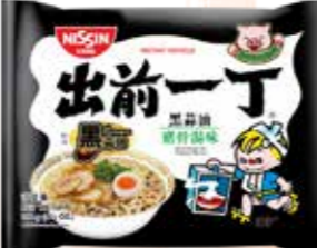
21010 TONKOTSU BLACK GARLIC RAMEN 3*30*100GR