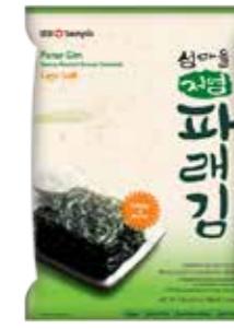
40018 SEASONED SEAWEED : LESS SALT (6+2) 12*(8*3.5GR)