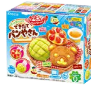
35012 DIY POPI'N COOKI'N DEKITATE BAKERY 18*5*27G