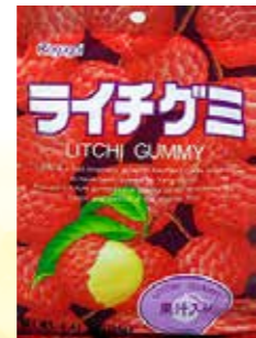
35034 LYCHEE GUMMY 2*12*102G