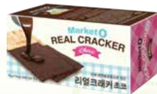
45012 MARKET O CHOCO CRACKER 16*96GR