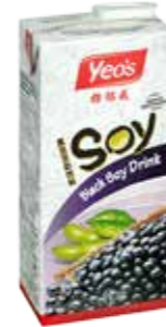
13002 BLACK SOY DRINK 12*1L