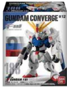
30005 FW GUNDAM CONVERGE 12 6*10*1PC