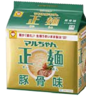
31008 MARUCHAN SEIMEN TONKOTSU 3*6*5*91G