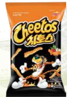
45013 CHITOS SNACK: HOT 16*88GR