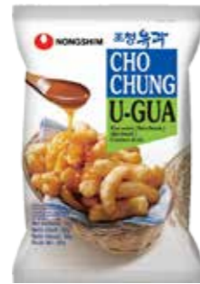
45006 CHO CHUNG U-GUA RICE SNACK 18*80GR