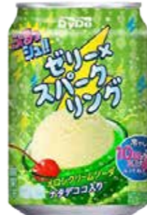
33007 PURUSSHU JERRY X SPARKLING MELON SODA 24*280G