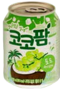
43004 GRAPE JUICE COCONUT 24*238ML