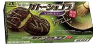
35024 MATCHA GÂTEAU AU CHOCOLAT 5*6*6PC