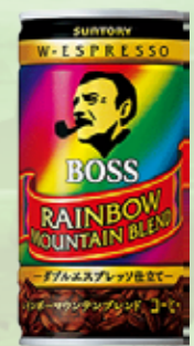
33027 BOSS RAINBOW MOUNTAIN BLEND COFFEE 30*185G