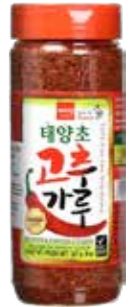
40019 PEPPER POWDER (CAN) 24*227GR