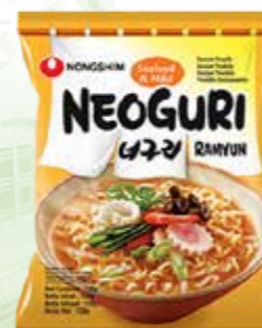
41008 NEOGURI MILD 20*120GR