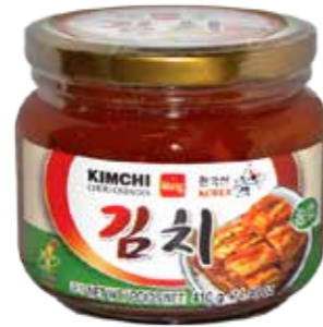
40006 MAT KIMCHI (POT) 12*410GR