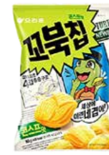
45021 CORN SNACK: ORIGINAL 12*80GR