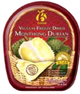
55005 DRIED DURIAN 24*100GR