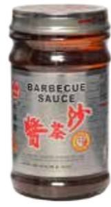
24007 BARBECUE SAUCE 24*127GR