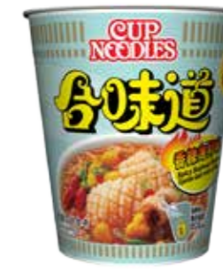
22002 SPICY SEAFOOD CUPRAMEN 24*75GR