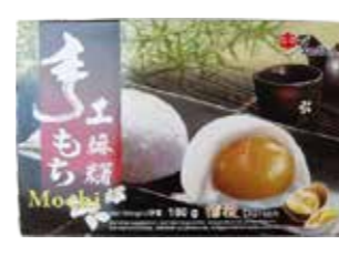
75007 MOCHI DURIAN FLAVOUR 20*180GR