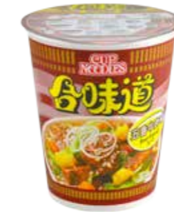
22005 BEEF CUPRAMEN 24*75GR