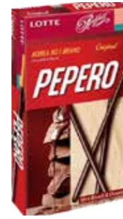
45016 PEPERO: CHOCOLATE 40*47GR