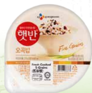
40015 COOKED RICE 5 GRAIN 24*210GR