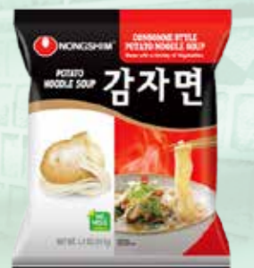
41011 POTATO RAMEN 20*100GR