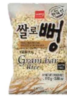
45025 RICE BAR SNACK 30*110GR