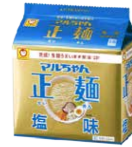
31009 MARUCHAN SEIMEN SHIOAJI 3*6*5*104G