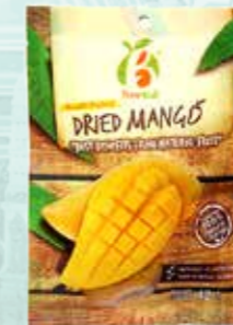
55001 DRIED MANGO 36*42GR