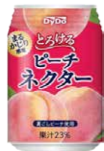
33005 TOROKERU MELTY PEACH NECTAR 24*270G