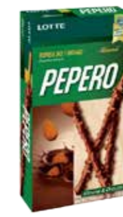
45018 PEPERO: ALMOND 40*32GR