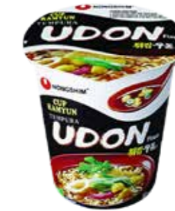
42006 UDON CUPRAMEN 12*62GR