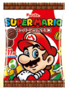
35032 SUPER MARIO CHOCO 6*10*32G