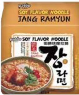
41018 JANG RAMEN (MULTIPACK) 4*(5*120GR)