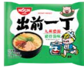
21007 TONKOTSU RAMEN 3*30*100GR