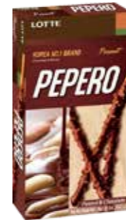
45020 PEPERO: PEANUT 40*36GR