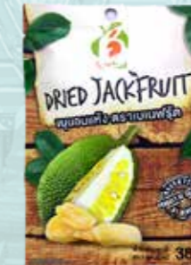
55002 DRIED JACKFRUIT 36*38GR