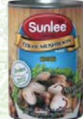
50013 STRAW MUSHROOM (BROKEN) 24*420GR