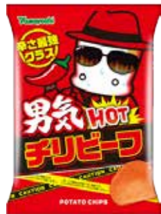
35028 POTATO CHIPS HOT CHILI BEEF 12*90G