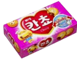
45009 BISCUIT KANCHO 48*40GR