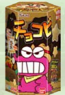
35019 CRAYON SHIN-CHAN CHOCOBI BBQ 8*6*25G