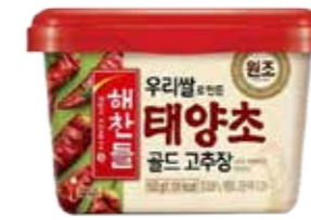
44001 RED PEPPER PASTE 20*500GR