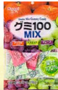
35035 GUMMY 100 MIX 2*12*102G