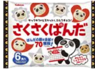
35020 SAKU SAKU PANDA FAMILY PACK 2*12*136G