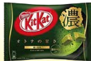
35002 KITKAT MINI DOUBLE MATCHA 2*12*128G