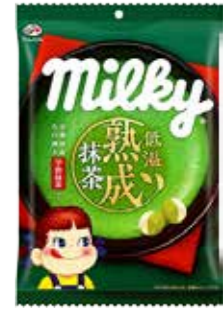
35039 MATCHA MILKY 8*6*80G