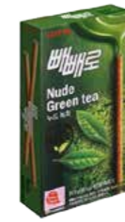
45017 PEPERO: GREEN TEA 40*39GR