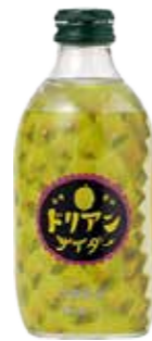
33038 DURIAN CIDER 24*300ML