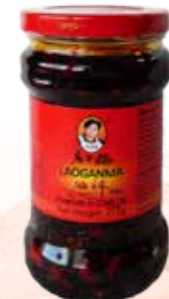
14002 PEANUTS IN CHILLI OIL 24*275GR