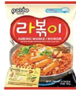
41014 RABOKKI 4*(4*145GR)