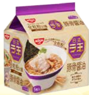
31005 RAO TONKOTSU-SHOYU 3*6*5*102G