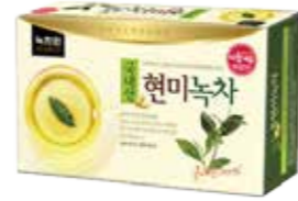
40003 BROWN RICE GREEN TEA 30*270GR