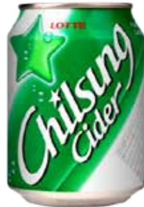
43005 LEMON SODA 24*245ML