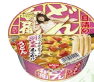
32002 DONBEI CUP TORO-TSUYU MENTAI ANKAKE UDON 12*80G