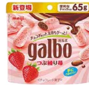
35009 GALBO TSUBU ICHIGO STRAWBERRY 6*8*65G