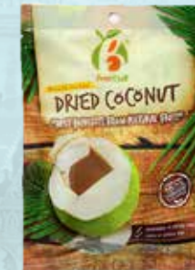
55003 DRIED COCONUT 36*42GR