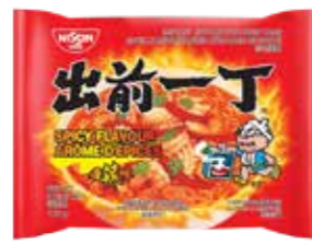
21006 SPICY RAMEN 3*30*100GR