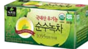
40005 ORGANIC GREEN TEA 10*10GR