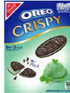
35027 OREO CRISPY MINT ICE CREAM 4*10*154G