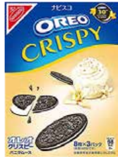
35025 OREO CRISPY VANILLA MOUSSE 4*10*154G