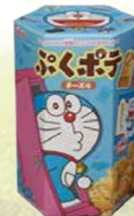
35016 DORAEMON PUKUPOTE CHEESE 8*6*20G