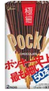
35004 POCKY GOKUBOSO 12*10*75.4G