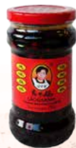
14001 PRESERVED BLACK BEANS IN CHILLI OIL 24*280GR