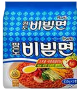
41017 BIBIM RAMEN (MULTIPACK) 4*(5*130GR)