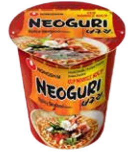
42003 NEOGURI CUPRAMEN 12*68GR