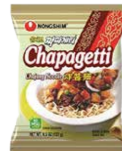
41004 CHAPAGETTI 20*140GR