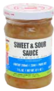
24010 SWEET & SOUR SAUCE 24*250GR