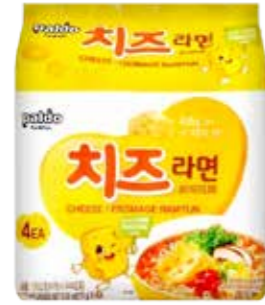
41013 CHEESE RAMEN 8*(4*111GR)