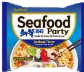
41019 SEAFOOD PARTY RAMEN 20*125GR