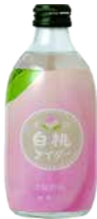
33036 JUICY WHITE PEACH CIDER 24*300ML