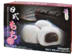
75003 JAPANESE STYLE MOCHI: RED BEAN 24*210GR