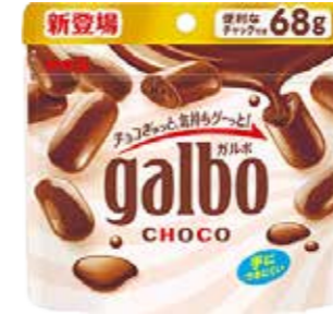
35008 GALBO CHOCO 6*8*68G