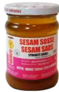
24012 SESAME SAUCE 24*250GR