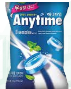
45027 ANYTIME CANDY 20*92GR