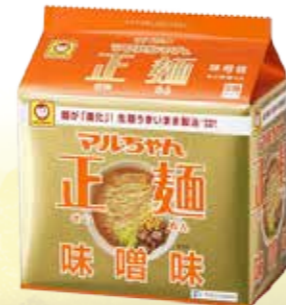
31007 MARUCHAN SEIMEN MISO 3*6*5*108G