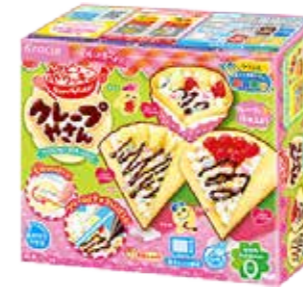
35013 DIY POPI'N COOKI'N CRAPE YASAN 18*5*27G