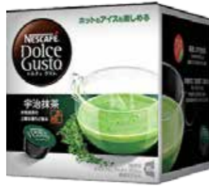
30001 NESCAFE DOLCE GUSTO CUPSULE UJI-MATCHA 3*16PC